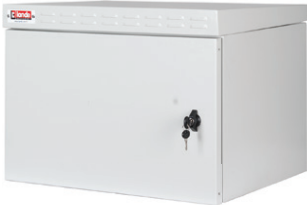
PROline 500-O series Safebox Outdoor IP55 Cabinets 7U/9U/12U/16U W600mm x D300/450/600mm

Mono-block welded construction, coated with polyester type powder, on RAL 7035 - Light Grey.